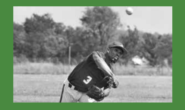
Exhibit provided through partnership with the SC State Museum and funds provided by Hospitality Accommodations Tax.

For more information: www.blscm.org or 864.710.9994.